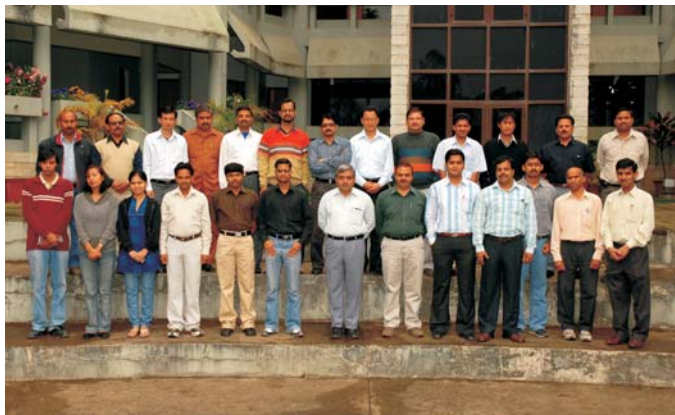
Group photograph of the course participants

A hard-copy lecture notes volume for immediate consultation after the lectures and practicals/tutorials was provided to the course participants during the course and a digital volume of the course materials was sent to them after the completion of the course. A CD containing free/open source software tools for SAR data selection, processing and analysis (DESCW, BEST and PolSARpro by European Space Agency, SARDA by Space Application Centre, Ahmedabad etc. ) was also supplied to the course participants.