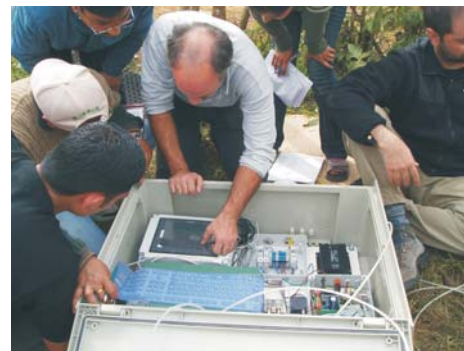
IRGA & Industrial Computer