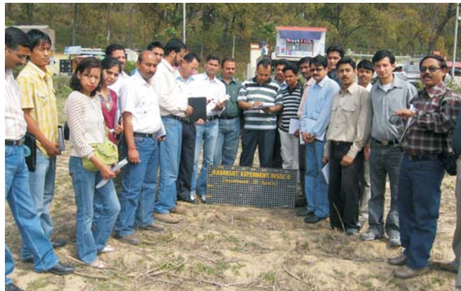
Course participants at field-based measurements