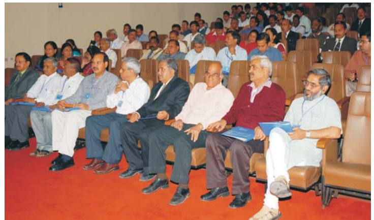
Workshop participants of EDUSAT Distance Learning Program